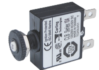
Push Button Reset-Only CLB Circuit Breakers (one included in retail package)