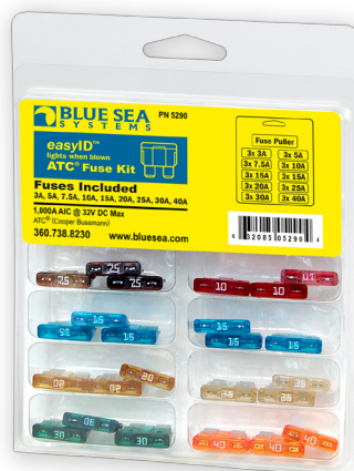
5290 31 piece fuse kit with fuse puller